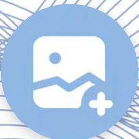
Image insertaion it helps to insert a image through QR code from mobile to whiteboard.